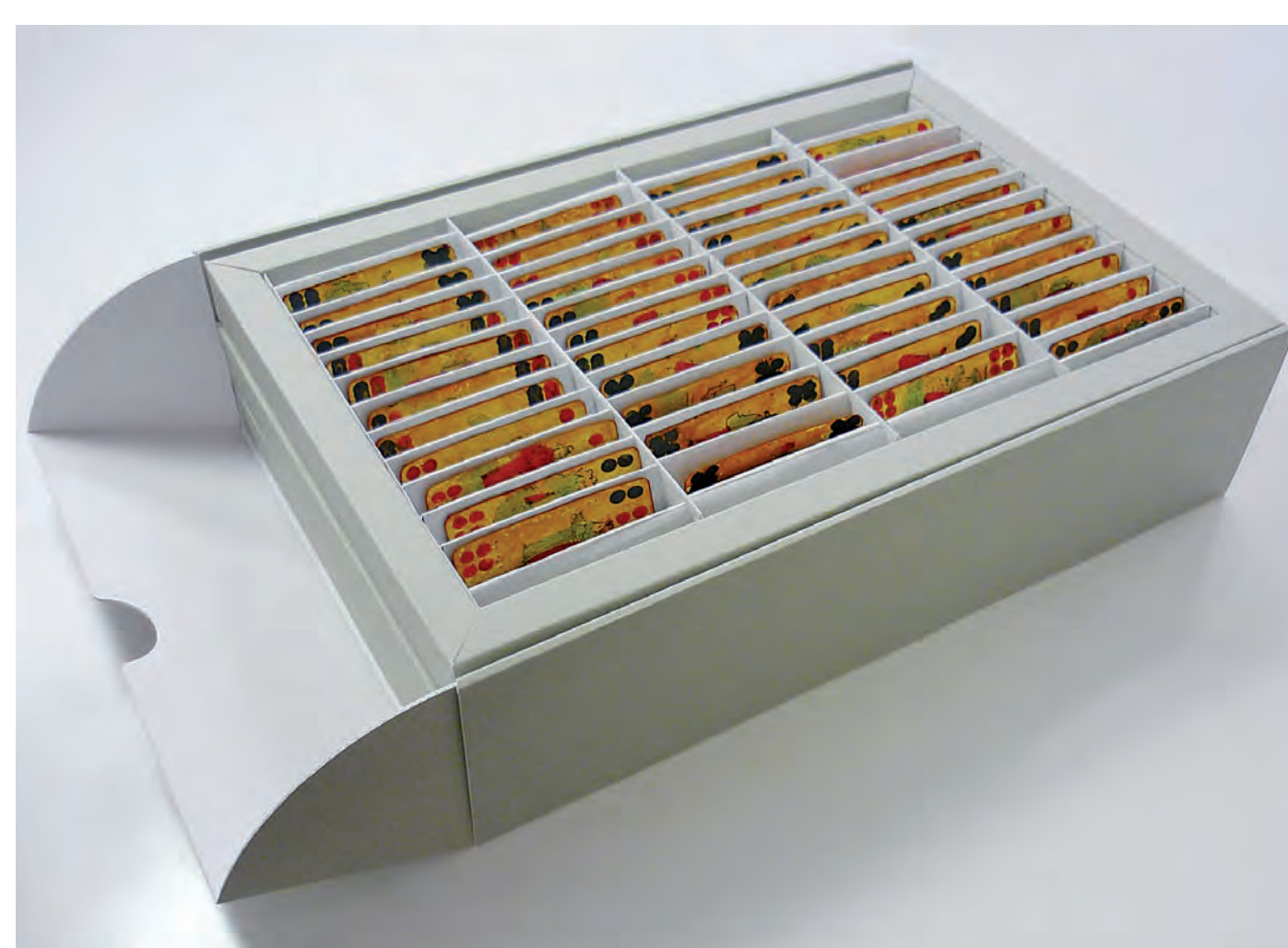
Fig. 3. Box with opened flap

which made the coating temporarily brittle and the cards separable (fig. 1).