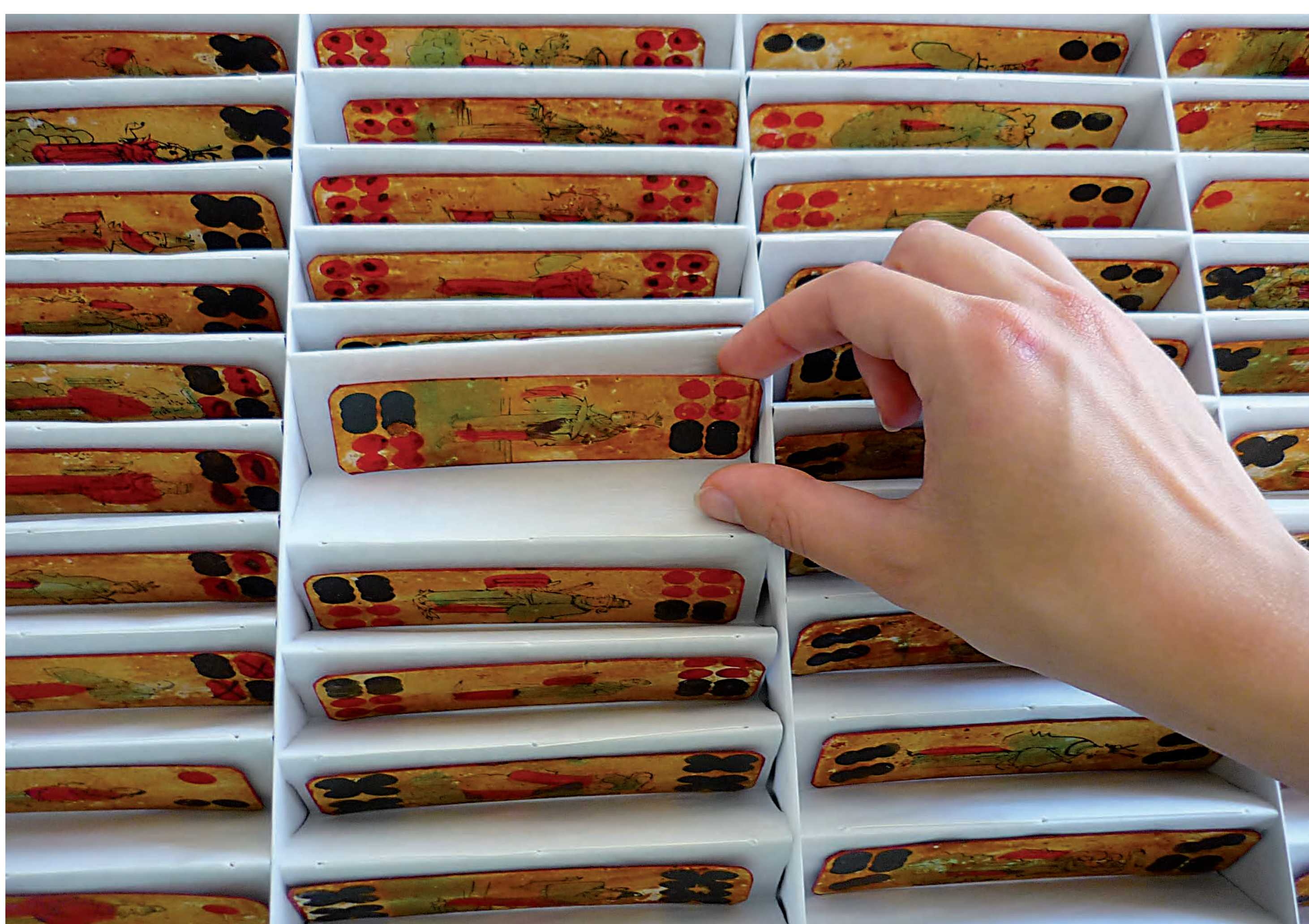
Fig. 5. Accessing a playing card in its compartment

furnished with concertina-folded supports, which are made from strips of archival board and silicone release paper. The release paper is sewn onto the board material with book binding thread and adhered to the tray at the ends (fig. 4). Silicone release paper (silicone-coated paper with a surface pH of 6.0) was chosen as the contacting support material because it proved to have the best separating properties, which is the most important factor when storing the sticky cards. The slightly acidic pH value is unlikely to have any adverse effect on the cards, which are coated with varnish. Each card rests in a separate compartment of this box and can be viewed without being touched or removed (fig. 5). The concertina-supports are fixed on the tablets only at their opposite ends, so that each individual compartment can be widened. This makes it easier to access the cards.