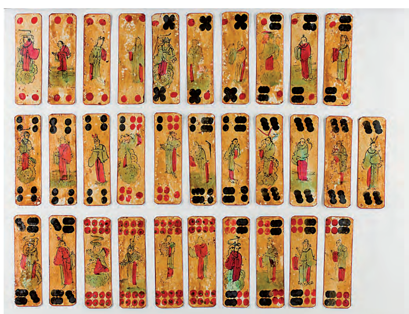
Fig. 1. Playing cards after separation